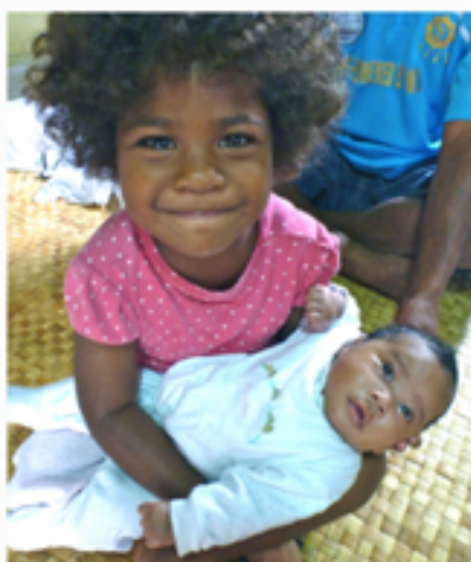
FEEDING & CLOTHING POOR - HOMELESS (S)