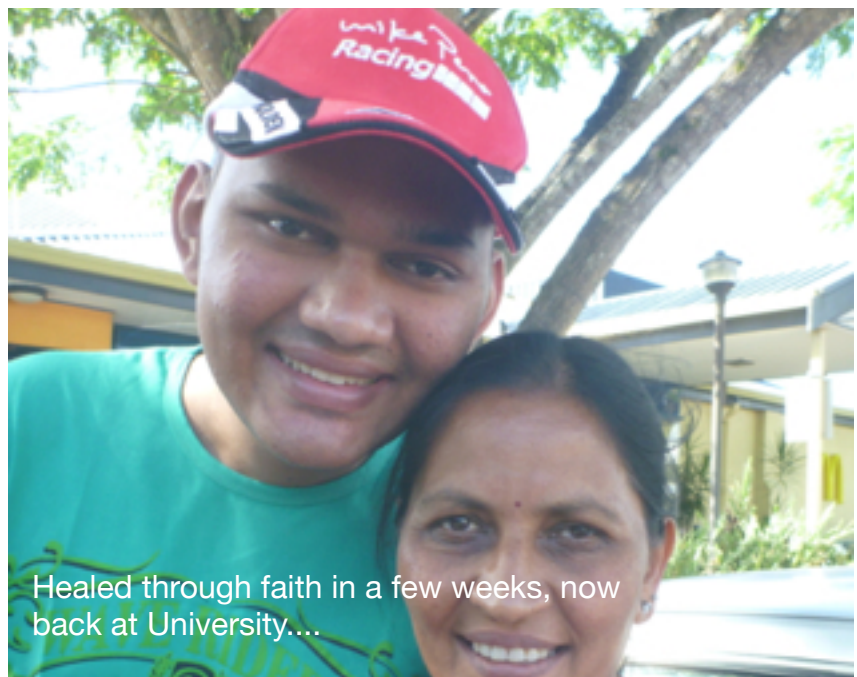
Healed through faith in a few weeks, now back at University....