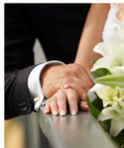
MARRIAGE COUNSELLING (S)