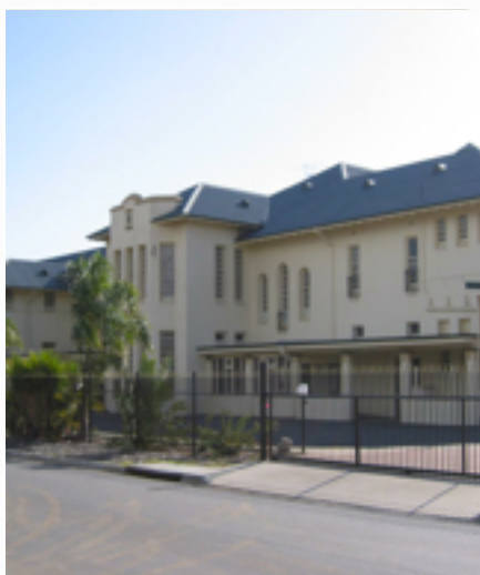
BIBLE STUDIES (ED)