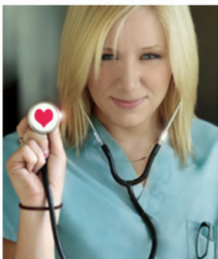
NURSING - TRIAGE, BLOOD TAKING, WOUND MGT (H)