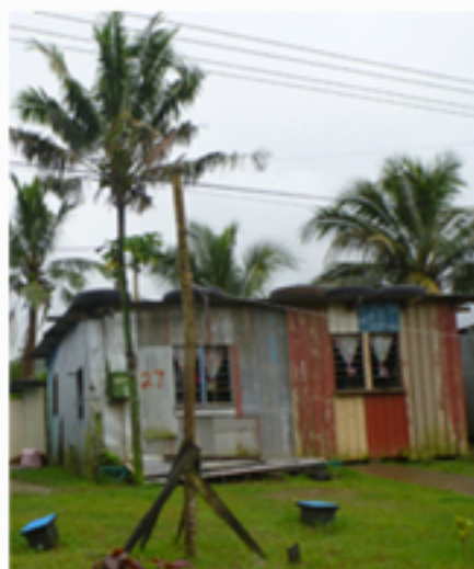
LOW INCOME HOUSING PROVISIONS (L)