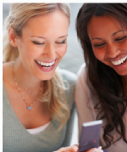
NUTRITION & COOKING EDUC. (REDUCE NCDS) (H) & (ED)