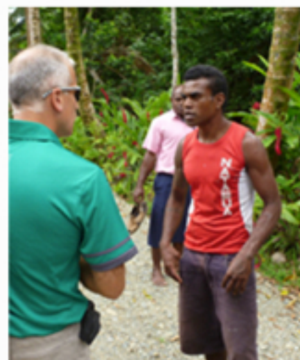
PRISON MINISTRY (S)