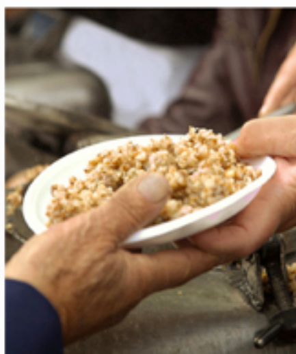
SUPPORTING OTHER COUNTRIES & MISSIONS (S)